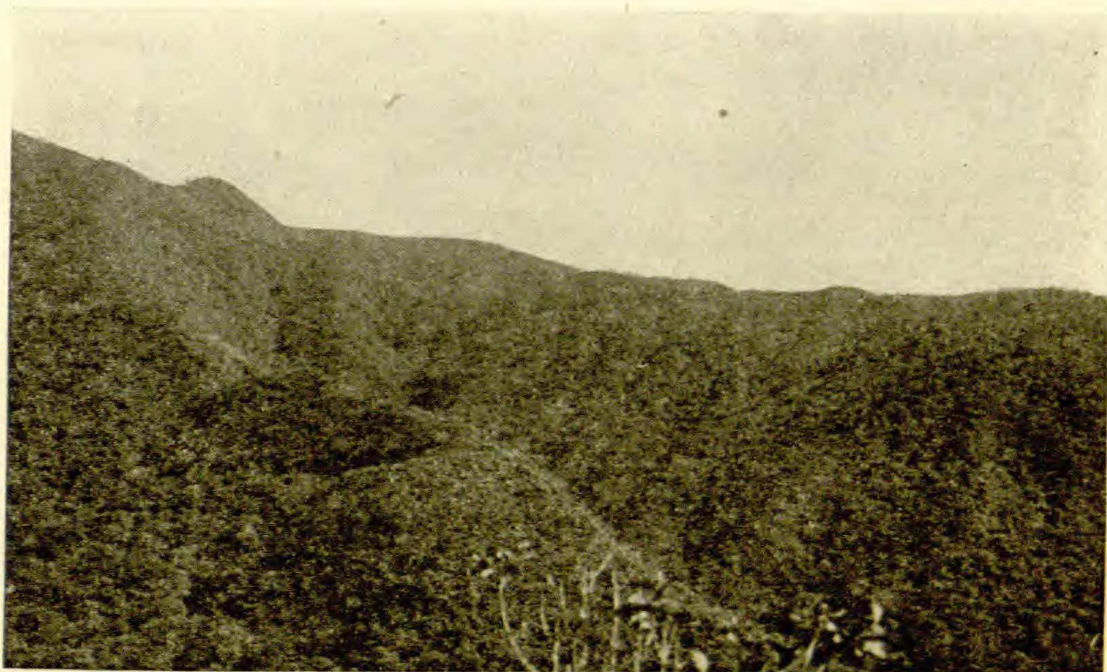
FIG. 2.—Oahu tapestry forest; montane rain forest

The steepness, wetness, and general inaccessibility of the tapestry groves have prevented wild cattle and goats from ravaging them. Thus they have been spared the devastations so